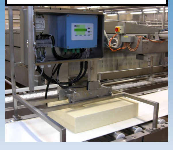
HK1-M for Milk, Curt, Topfen measurement